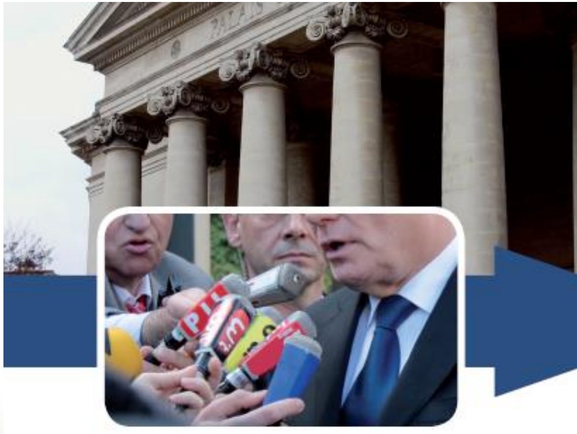
THESSALONIKI – 1st July 2015 Conference on Leadership